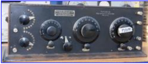
Figure 4 — An Adams-Morgan Paragon RA-10 spotted in the boneyard of the Dayton Hamvention® in 2007. Note that the asking price of $950 is close to the equivalent value of the receiver in 1922.