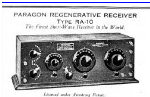
Figure 3 — An illustration of the Paragon RA-10 regenerative receiver from a 1922 Adams-Morgan catalogue immodestly promoted as “the finest short-wave receiver in the world.” In 1922 the set sold for $75, which is equivalent to some $920 in today’s currency. or, as he called it, a “Gamma Sniffer.”